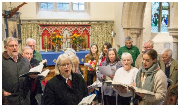
Members of the special choir rehearse